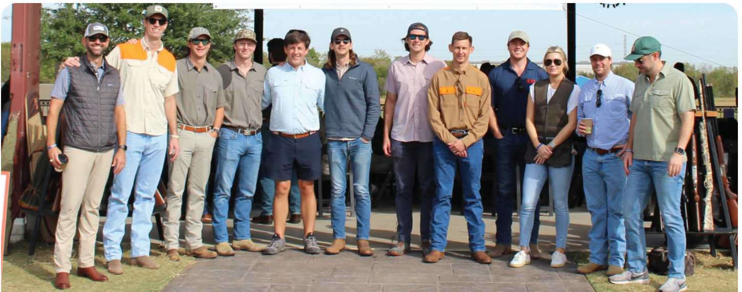
Special Thanks to Members of the Host Committee